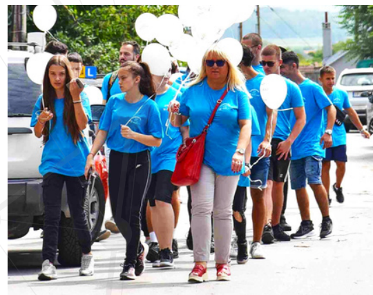
Udruženje građana Svet reči