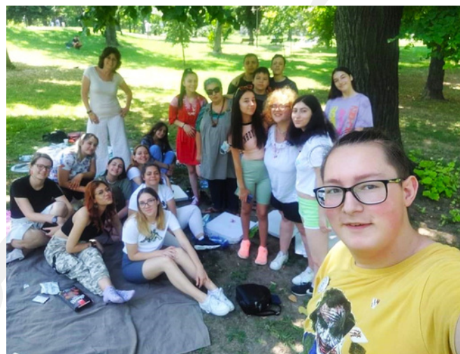
Dečiji centar, Serbia

“The UN invited us to the presentation of the Report on the State of Human Rights of Persons with Disabilities in Bosnia and Herzegovina. We raised the question about to what extent safe houses are accessible for women with disabilities and about the unequal access to voting in elections for blind people in BiH, which representatives of our partners from Serbia and Montenegro also pointed out. Here the voices of women with visual impairment were heard.” (grantee partner)