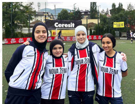
Udruženje NOVA ŽENA