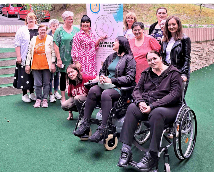
Bočarski klub osoba s invaliditetom Nada grada Požege i PSŽ