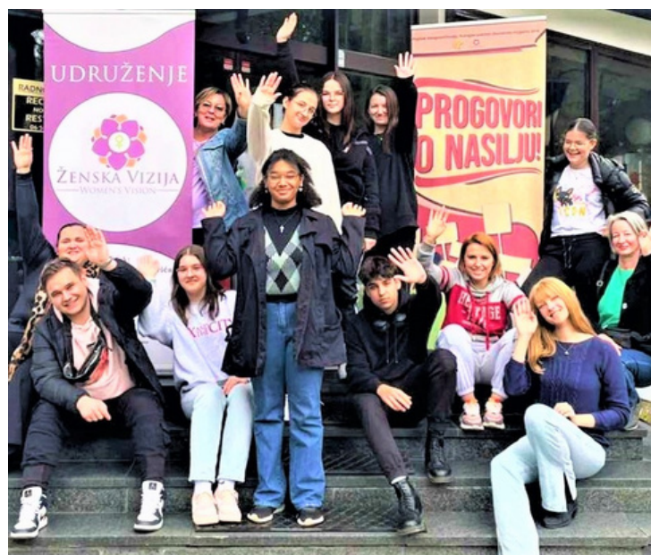
Udruženje Ženska Vizija, Bosnia & Herzegovina