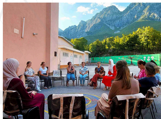
Udruženje za edukaciju i razvoj Dignitet