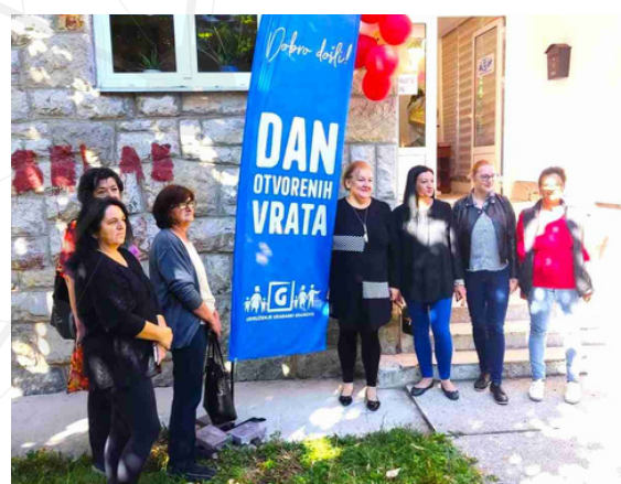
Udruženje građanki Grahovo