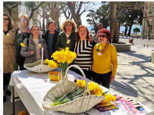
Klub žena liječenih na dojci